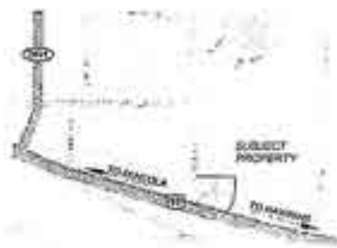
LOCATION MAP NO SCALE